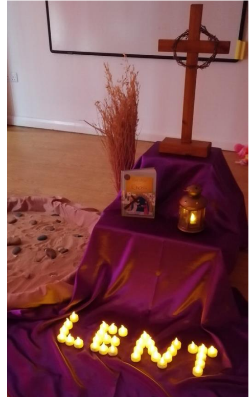
Our school chapel

We are planning and leading 'Stay and Pray' worship for our families which help us to spend time in prayer with Jesus.